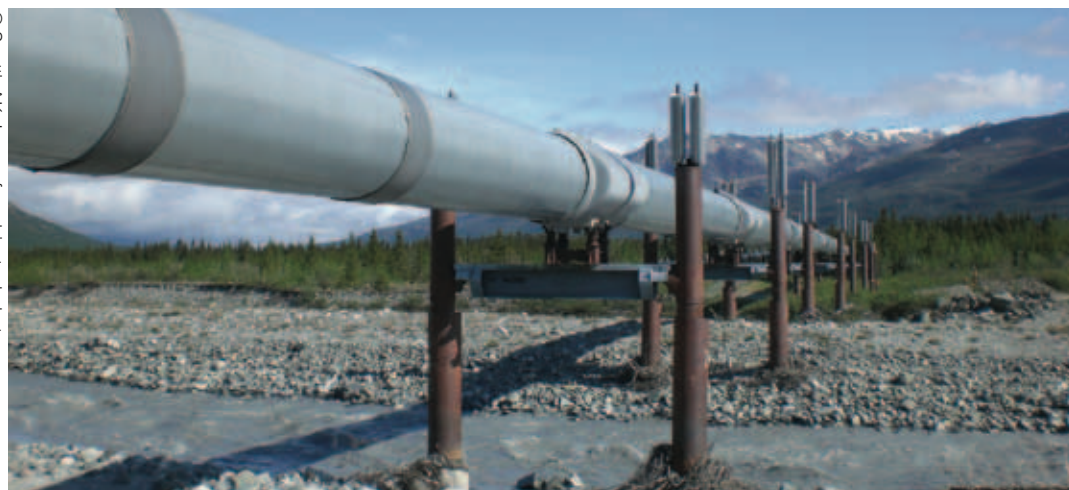
Bio-based fuels are very susceptible to destabilisation from low level metal contamination - something which is very difficult to control in the distribution supply chain

This article was written by Peter Bluemel, SBZ, www.sbzcorporation.com